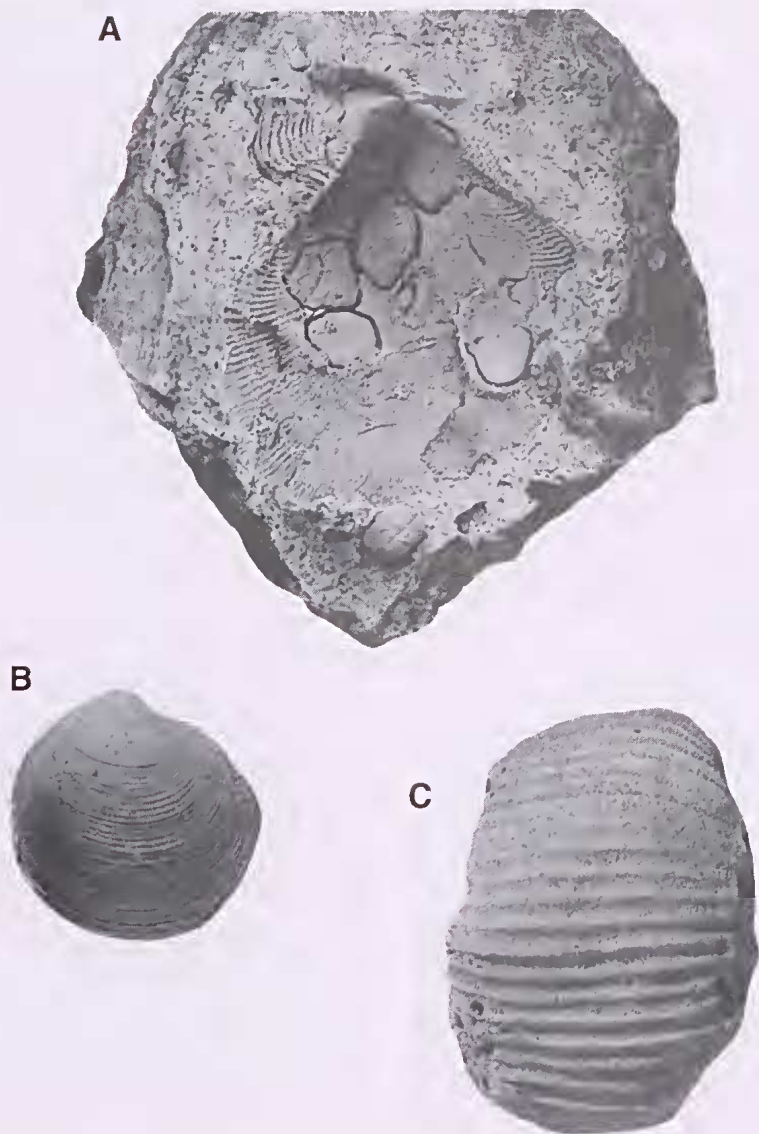
Figure 2. Molluscs from the Cadda Formation, Enanty Hill. A WAM 99.368. Camptonectes greenoughi Skwarko. Natural mould of right valve exterior with moulds of attached juvenile oysters, x 2. B WAM 99.370. Lucinidae, genus unidentified. Latex cast of right valve exterior, x 1.8. C WAM 99.374. Pseudotoites sp. Latex cast of venter, x 1.8. All whitened.

collections from Enanty Hill and elsewhere in the Cadda Formation (Coleman and Skwarko, 1967; Playford et al. 1976). The type locality, omitted